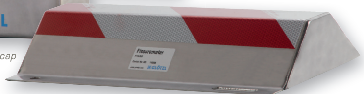
Fig. Run over protection