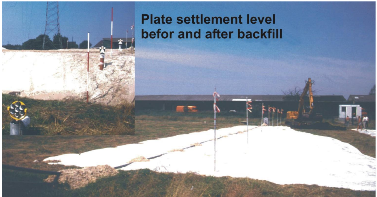
Plate settlement level befor and after backfill

Type: GPSP – S 40/1 - V 40/1 Art. No.: 84.90